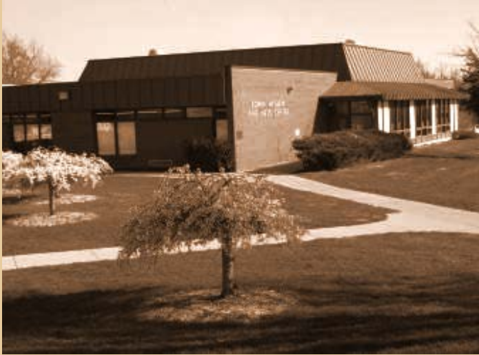
WILLIAM PENN UNIVERSITY, MCGREW ARTS BUILDING

Hey there, future Picassos and digital da Vincis! If you're passionate about unleashing your creativity and fearlessly embracing the artistic journey, this one's for you. Art majors often get the side-eye when it comes to job prospects, but let me tell you, that's nothing but a big ol' myth! The truth is, your art degree is a superpower that can lead you down a rabbit hole of amazing and realistic career opportunities. So, let's dive into this colorful world of possibilities!