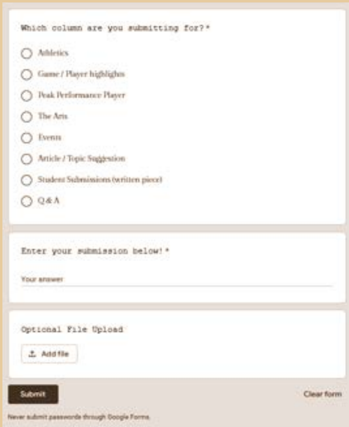
Penn & Ink Newspaper Submissions Form Pt. 2

You can also interact with us on our instagram page, @wmpennandink, through email,