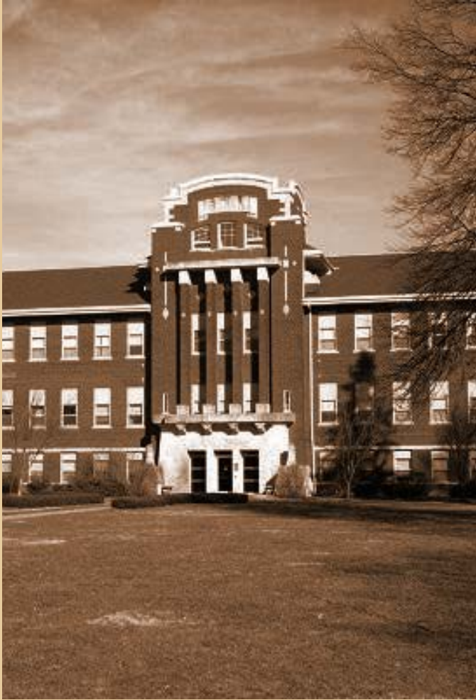
WILLIAM PENN UNIVERSITY, PENN HALL