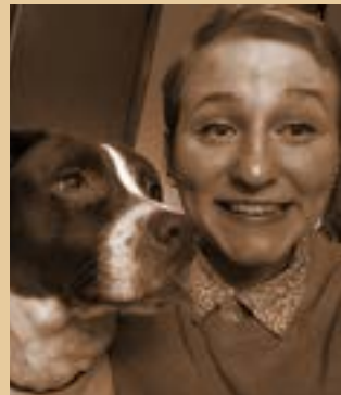
View Artist Profile Here!