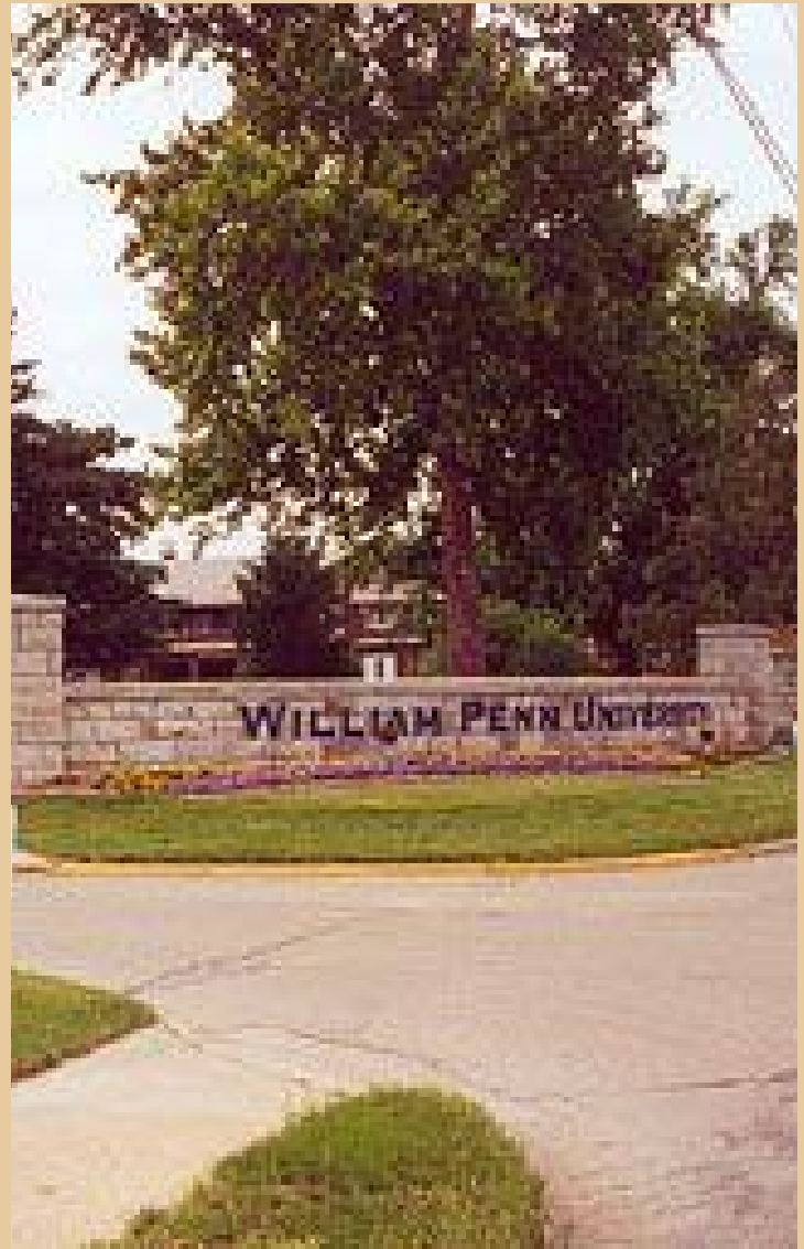
WILLIAM PENN UNIVERSITY SIGN

All WPU Students receive 10% off in store at Book Vault!