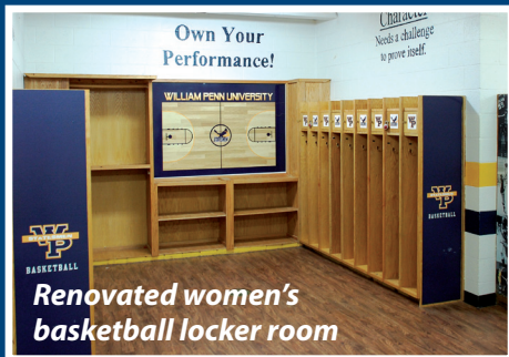
Renovated women's basketball locker room