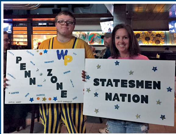
William Penn Booster Club members cheering on the Statesmen at a tailgate event

The Booster Club launched an online apparel store where members receive discounts. Visit www.statesmenathletics.com then click the WPU Athletics Apparel Store link on the right-hand side of the page and use event code "penn".