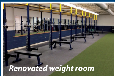
Renovated weight room