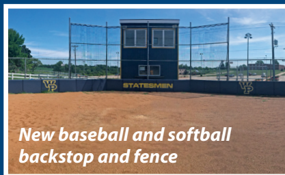
New baseball and softball backstop and fence