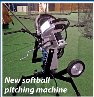
New softball pitching machine