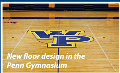
New floor design in the Penn Gymnasium