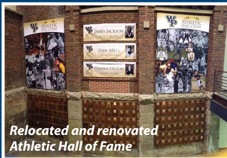
Relocated and renovated Athletic Hall of Fame

Yes, sign me up for the William Penn Athletic Booster Club!